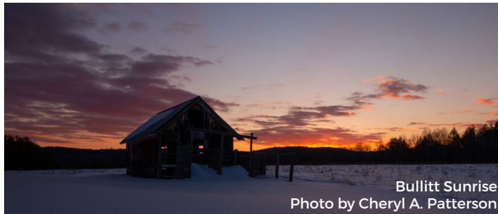
Bullitt Sunrise

Suggested donation: $10/$5 (HLT Members) Pre-Registration required.