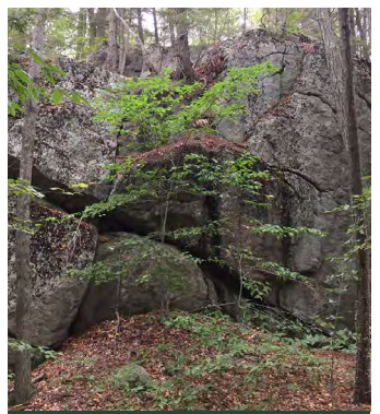
Rock outcrop on the Conwell property

Visit our website to download a map, get directions, and learn more about the property or about volunteering.