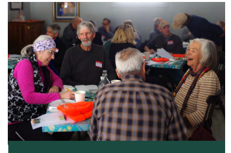
Volunteers enjoying the trivia game and each other

Our mighty volunteer base is still the heart of our organization