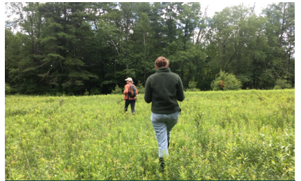
Previously logged and farmed fields, now vibrant meadow habitat.

Site visits to Clary Hill have shown us that wildlife is already using a rich mosaic of habitats.