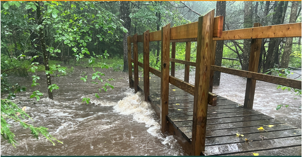
Nearing high water at the Historic Dam Trail in Williamsburg.