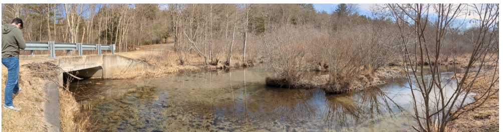
The MVP team studying the Mill River in Williamsburg.