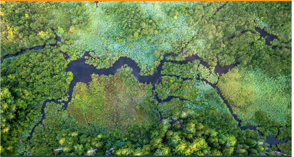
Sears Meadow.