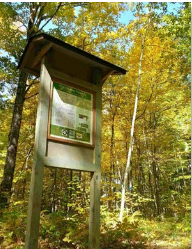
New Kiosk, Pisgah Road Trailhead

into the more remote east end of the property including the 1,543-foot summit of Mount Pisgah. This trail network is an excellent venue for longer hikes with connecting trails to the center of Westhampton and Route 66. Visitors are welcome to use the property in any season for passive recreational activities. The property is home to an abundance of wildlife including moose, bear, coyote, and many other mammals. The overlook offers nice views, particularly in winter.