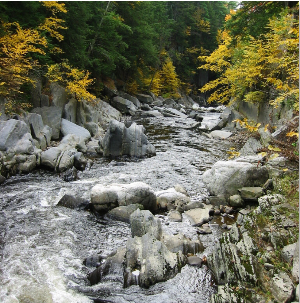
East Branch ?